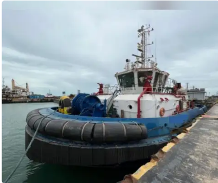
28m 55TP ASD Tug